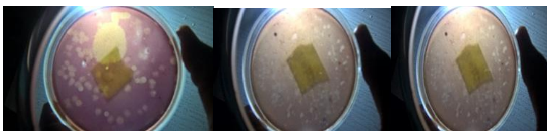
Figure 2 Microbial count